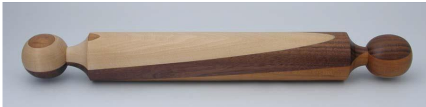
Figure 5 – Osolnik Style Rolling Pin

I first saw this style of rolling pin in Rude Osolnik's craft shop in Berea, KY in the late '70's or early '80's. While Rude was best known for his candle sticks, he also made many rolling pins with the characteristic round ball on the ends. Although I've never kept any data, this is probably my best selling rolling pin. An example is shown in Figure 5 below.