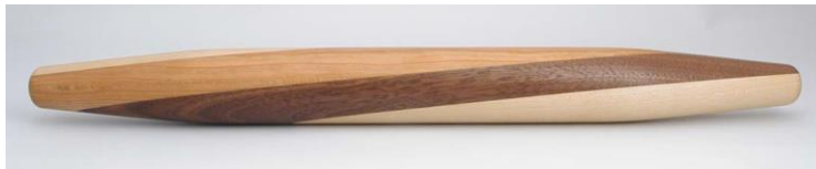
Figure 6 – Tapered Pastry Style Rolling Pin

In recent years these style of rolling pins have become very popular. There are many variations, but I have settled on two styles, one with tapered ends and one with a straight cylinder.