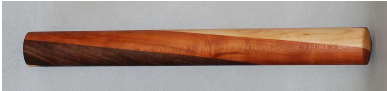
Figure 7 – Straight Pastry Type Rolling Pin

Another variation is to make the rolling pin a simple straight cylinder as shown in Figure 7 below.