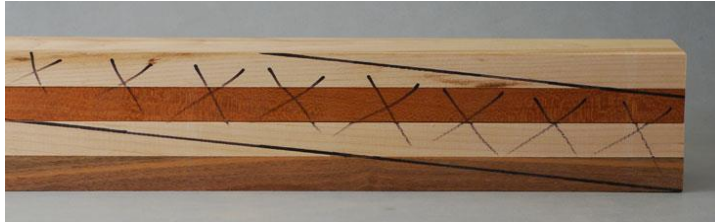
Figure 3 – Mark-out the Glued-Up Blanks