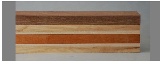
Figure 2 – Stacked Boards Prior to Glue-Up