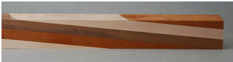
Figure 4 – The Finished Rolling Pin Blank

You are now ready for the easy part----making a rolling pin.