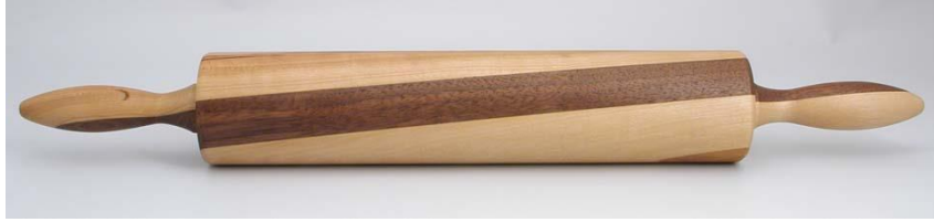
Figure 8 – Traditional Style Rolling Pin