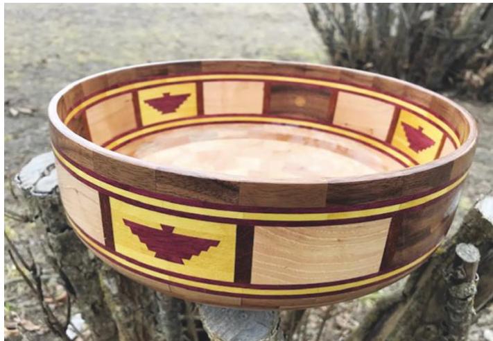
Hill Country Turner Chris Buckingham created this segmented bowl, which incorporates 337 individual pieces of wood from one of the courthouse pecans.