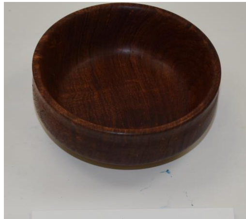
Sue Bates, Yes she can!!