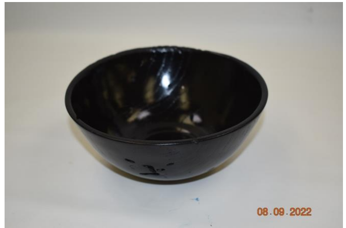
Don Kaiser Hackberry. Blasted, textured, black lacquer