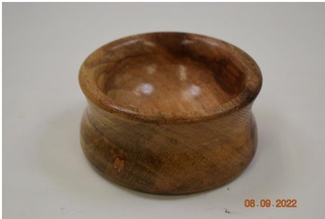
Gay Dittrich Pecan. FIRST TURNING