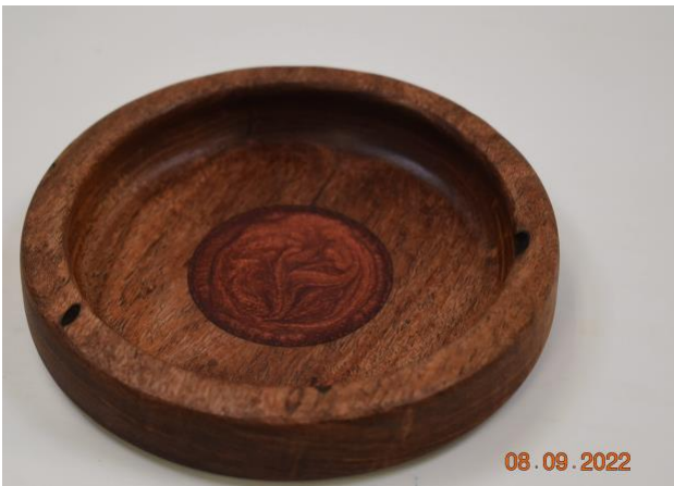
Sue Bates, Ring repair

Announcements: We had a great turnout for the September meeting. Plenty of show and tell items were presented. Thanks as always, Larry Turley, for the photography. Nice recovery, Sue, on the ring repair in picture 1. Look at picture 3. FIRST TURNING. YES!