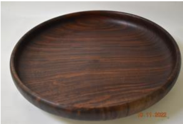
Tom Whiting Black Walnut. Mahony finish