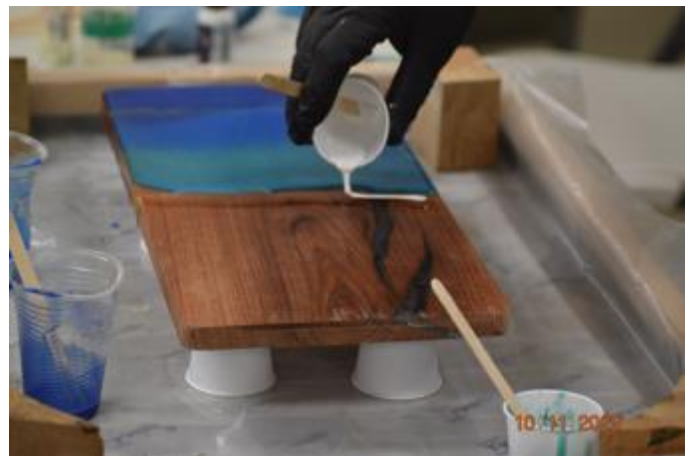
Base colors added and accents color applied