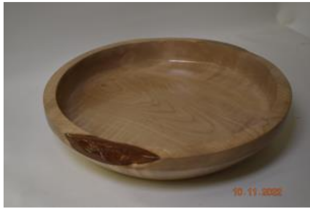
Rick Webster. Mystery Wood