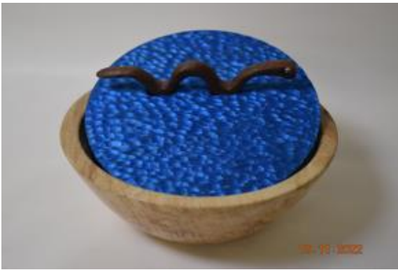
Wendell White. Maple