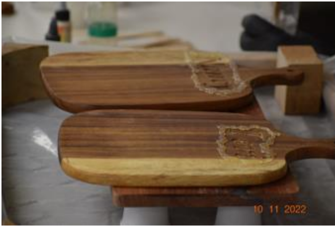
Making a hot glue dam