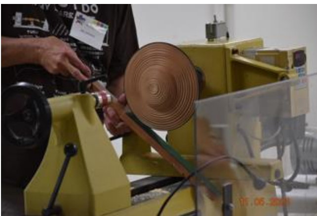
Adjusting a platter's wobble under vacuum