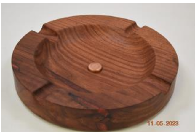
Kirk Bates, Cigar Ash tray, Mesquite