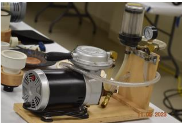
Diaphragm pump set-up with valving