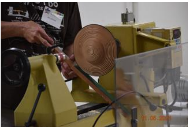
Adjusting a platter's wobble under vacuum