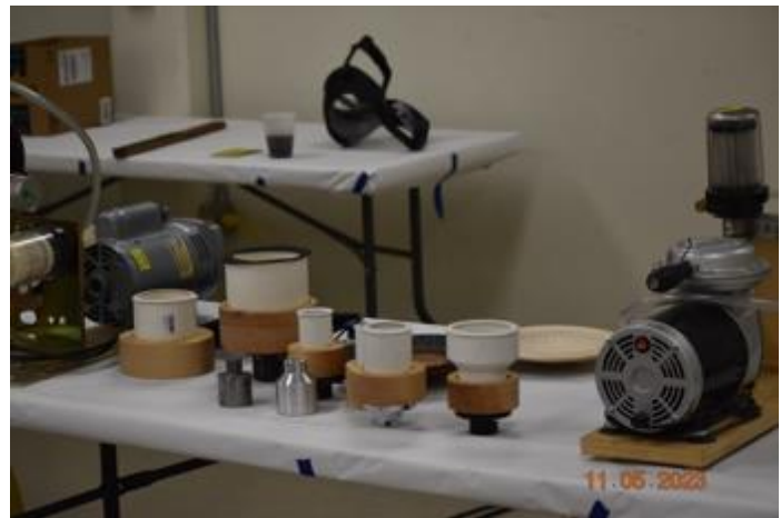
Pumps and various vacuum chucks