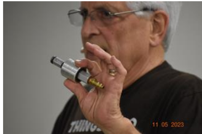
Adaptor to connect vacuum pump to lathe headstock and vacuum chuck