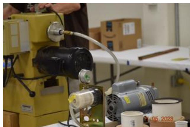
Complete set up with rotary vane vacuum pump and vacuum adaptor