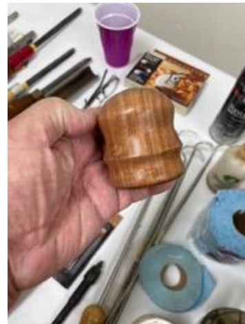
Bottle stopper hidden inside