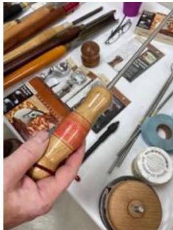
Decorated meat pigtail