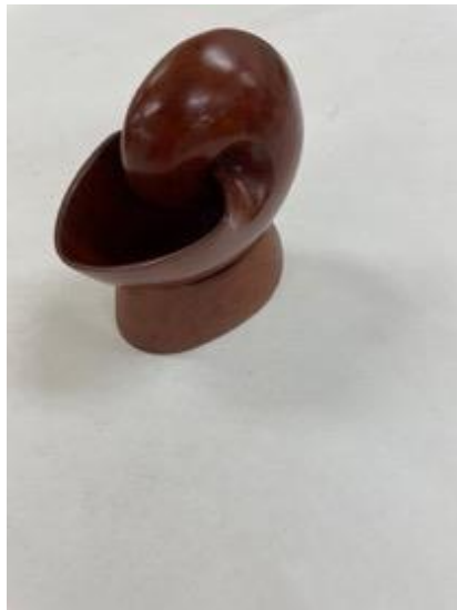
Raul Peña Cherry Cephalopod