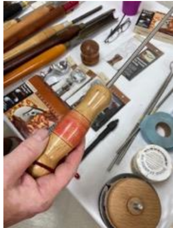
Decorated meat pigtail