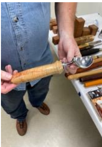
Ice Cream Scoop