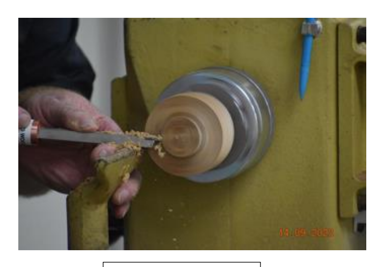
Shaping the Lid