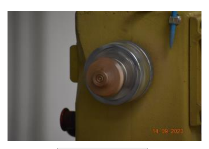
Embellish the Lid