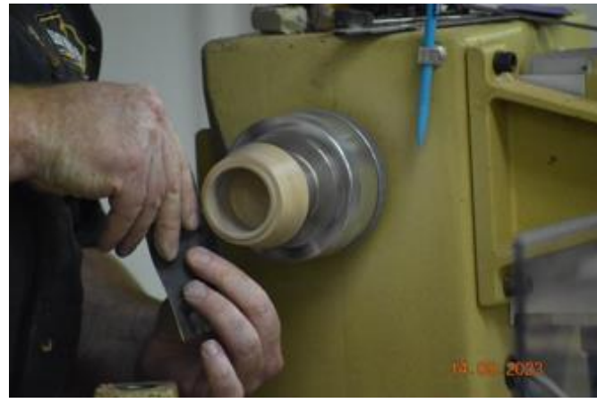
Sanding the box