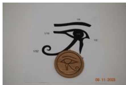
Raul Peña, Design