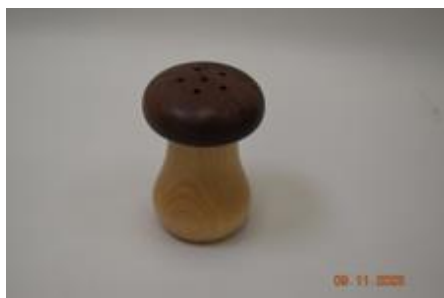
Joe Johnson Walnut/Maple/toothpick holder