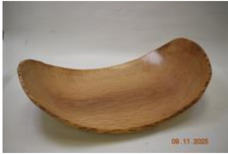
Tom Canfield Live Oak, tree cut down 2011 for shop build, returned 2023