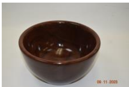
Roger Arnold Walnut/CA glue

It was good to see so many members present at the November meeting. Below are pictures of the show and tell items presented. Be sure to bring your latest inspiration/creation to the next meeting on January 11 th , 2024. Please inspire us with your latest turnings