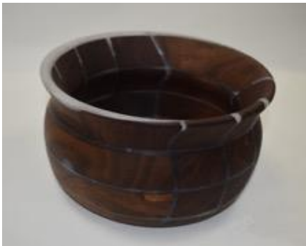
Tom Whiting – Black Walnut & Resin