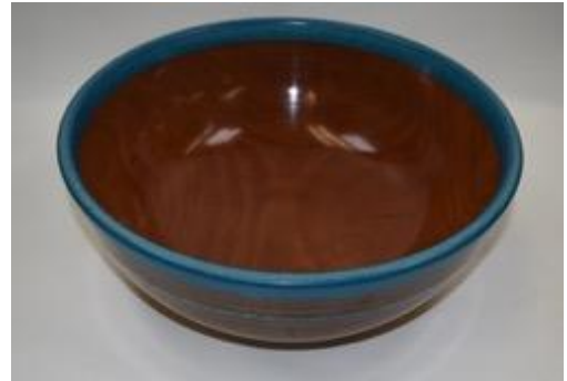
Roger Arnold – Walnut & Epoxy