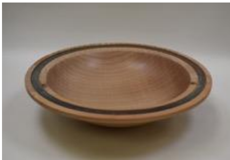
Barbie Holton – Quilted Maple