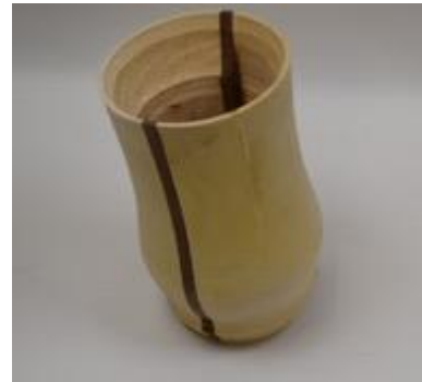
Tom Canfield – Boxelder Repair