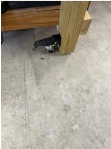
Wheels added to bench

I have recently downsized, as well as added some shop equipment. I faced the space problem many of us have, and answered it by placing wheels on equipment and work benches. Having done so, I can shift the bulky tools and benches to allow use of the desired tool.