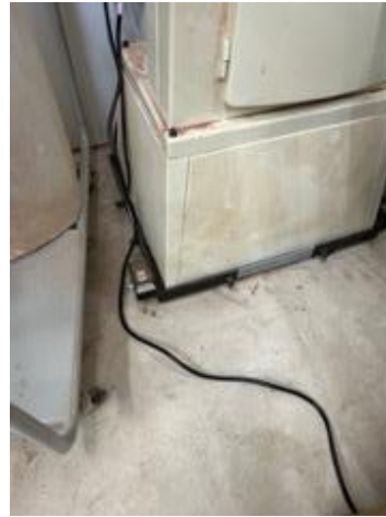
Wheeled sled added to bandsaw