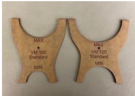
Chuck Tenon Gauge