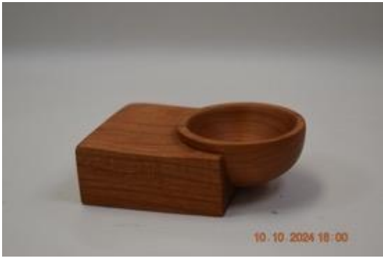
Tim Lutman, Cherry. "Emerging Bowl"

Please note the separate attachment for September Show-and-Tell items. The September pictures were not available at press time last month.