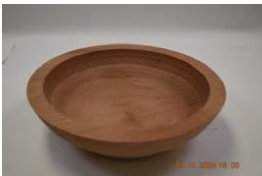
Tom Canfield, Raffle wood, Cherry?