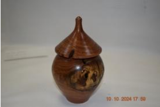
Tim Lutman, Lidded mesquite box, inlaid copper tip