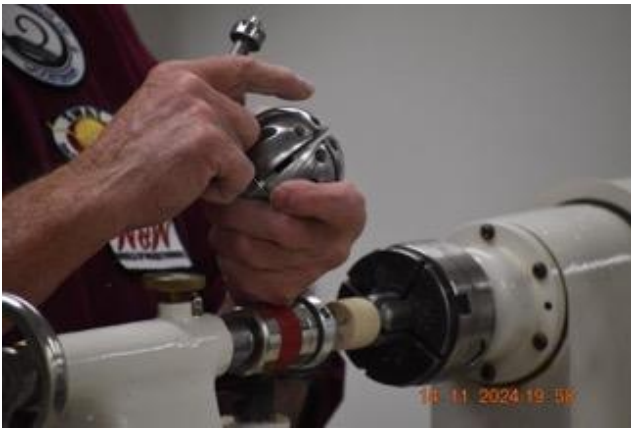
Record Power vise with knuckle saving jaws