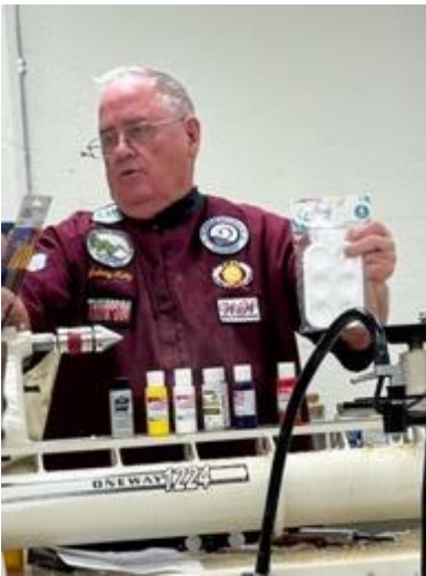
Some color possibilities