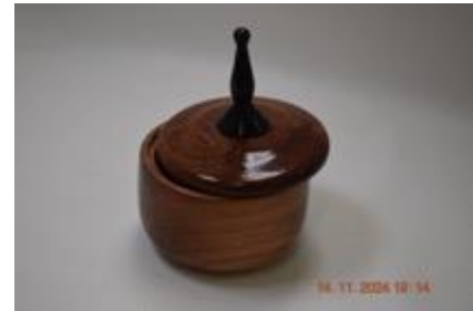
Roger Arnold Chechen base, rosewood lid, myrtle finial