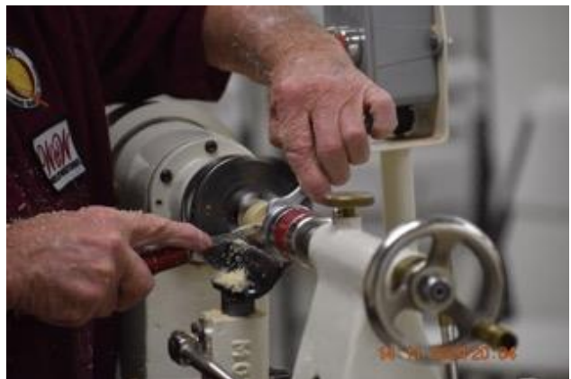
Tenon sizing with open end wrench