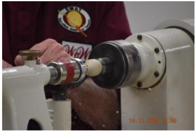
Turning a Christmas ball ornament