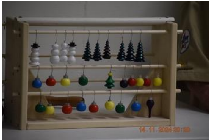
Display with ornaments colored