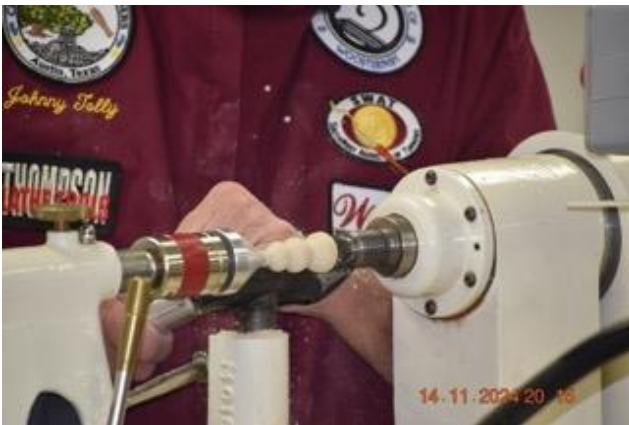
Turning a Christmas tree