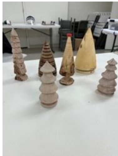
Some of the ornaments