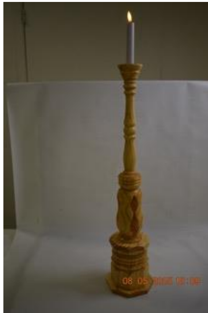
Tom Canfield, 2x4 First Place 25-1/4”