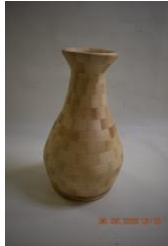
Wendell White, Maple, Purple Heart unfinished