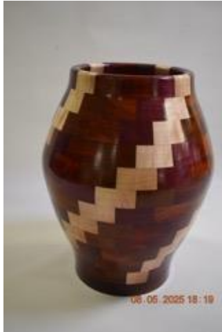
Wendell White, Maple, Purple Heart Padauk, Walnut