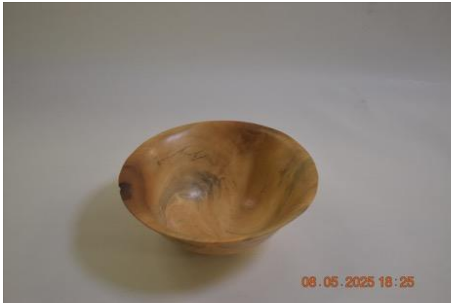
Tulip Poplar from the Thomas Jefferson Monticello Estate