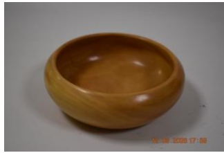
Tom Canfield, Yellow Mora