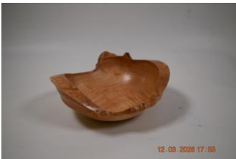
Tom Canfield, Ash, Natural Edge