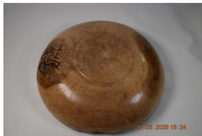
Will Deaton, Oak