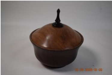
Don Gibson, Walnut Bowl, African Blackwood Finial