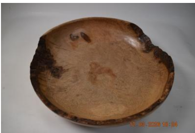
Will Deaton, Oak