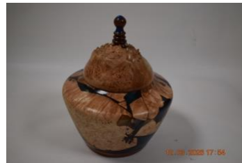
Tom Whiting, Big Leaf Maple, Resin