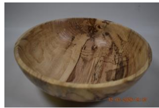
Dale Gleichweit, Spalted Hackberry